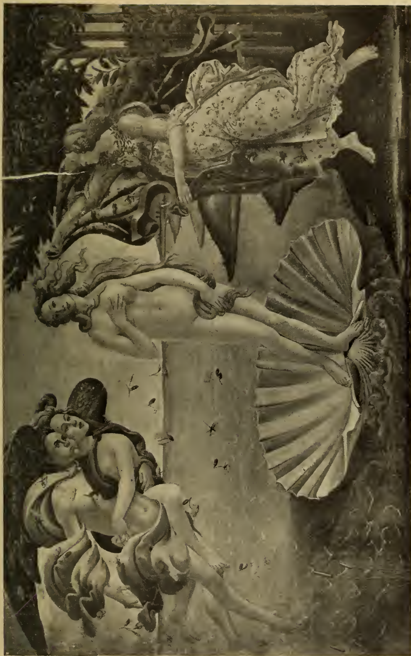
THE BIRTH OF VENUS FROM THE PAINTING BY BOTTICELLI IN THE UFFIZI